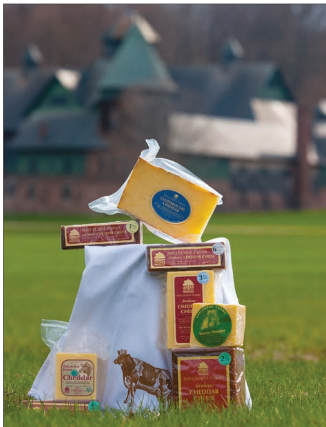
A variety of Shelburne Farms cheddars await the buyer—cheeses ranging in age from 6 to 9 months up to 3 years.

Of the 1,100 acres that constitute the farm portion of Shelburne Farms, 250 are managed for wildlife. A big part of that relates to protecting the nesting sites of grassland songbirds. In 2002, Noah Perlut began studying grassland birds at Shelburne Farms as part of his PhD research, and continued research has shown that haying early and frequently through the summer conflicts with grassland birds’ nesting cycle. Based on data collected, Noah and his colleagues recommend cutting earlier than otherwise, then waiting 65 days before mowing again. Shelburne Farms has adopted this practice on a significant portion of their hayland, and continued research