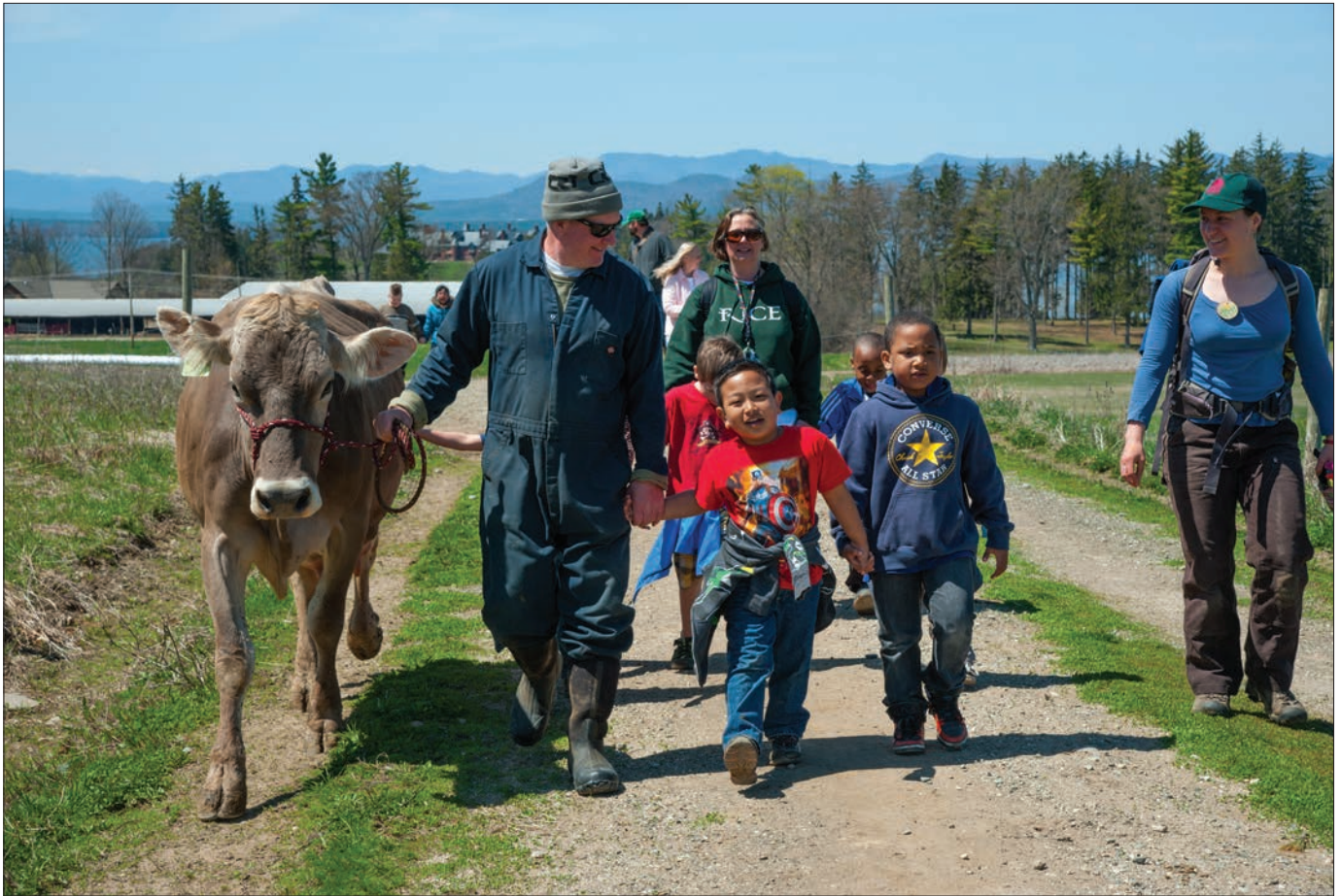
Children tag along as the cows are brought in from the pasture, where the herd gets 50 percent of its forage between the months of May and October; the farm was one of Vermont's first to practice grass-based dairy farming.